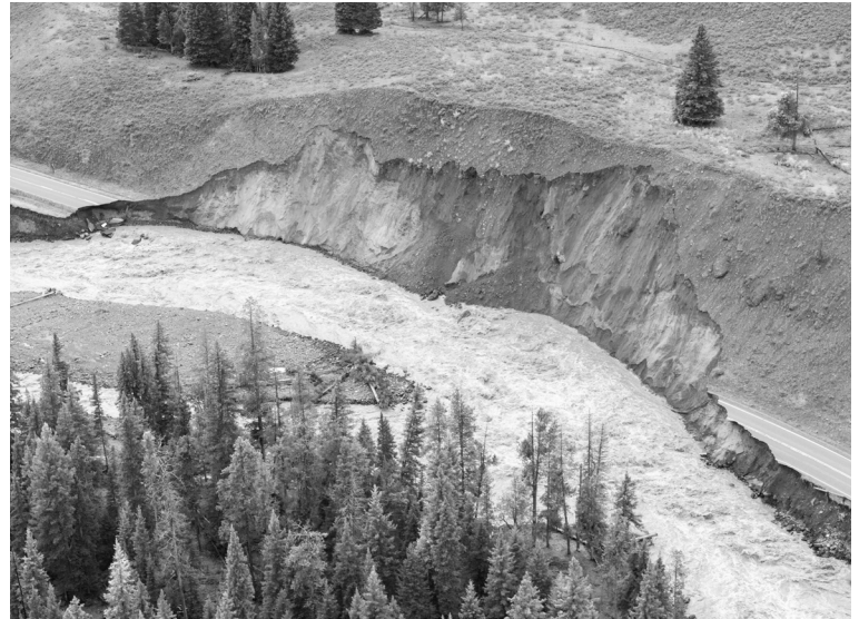
One of many washouts on the Northeast Entrance Road from Tower-Roosevelt to Cooke City, MT.

In the second week of June 2022, days of exceptionally heavy rain fell across the park. This new moisture combined with melting snowpack swelled rivers and streams, with many leaving their banks. Across the northern part of the park and continuing north into Paradise Valley, Montana, flow levels exceeded all previous records. River banks were eroded. Mud and rock slides were set off. Roads and bridges were overwhelmed.