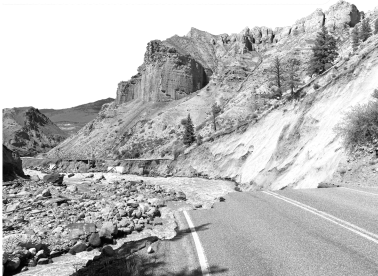
One of many washouts on the North Entrance Road from Gardiner, MT, to Mammoth Hot Springs.